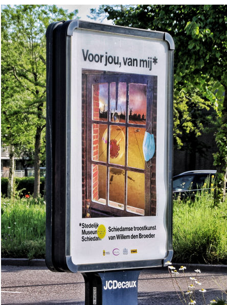
"Het Raam" 2020 Now in Stedelijk Museum Schiedam.

Do not paint what you can photograph © WdBroeder2000